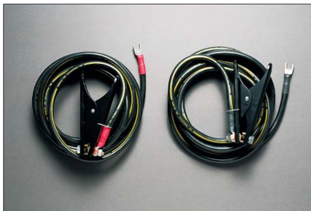
Cable set GA-05052